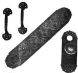
HARDWARE, Cast Iron w/Bronze Barff Finish. Chicago Stock Exchange, etc.

In conjunction with the Sullivan exhibit opening, the Junior Board of the Art Institute of Chicago will host a benefit from 8 PM to 10:30 PM on July 22nd at Architectural Artifacts. For reservations for the benefit, call (312) 853-5941. □