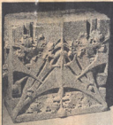
An ornamental glazed terra cotta block is representative of the design elements Sullivan used in his buildings.

Starting Friday, patrons can view the exhibit for free during regular store hours (10 a.m. to 5 p.m., Monday through Sunday).